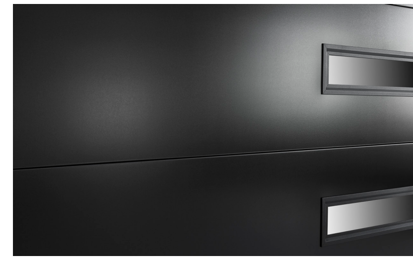
{\sf EOS}\, in\, {\sf Black}\, with\, {\sf Black}\, frame\, {\sf SlimLine}\, windows

Smooth as ice. The Amarr EOS smooth flush garage doors feature a sleek, minimalist design with a flat, uninterrupted surface that enhances the aesthetic of any home. The combination of heavy-duty steel, polyurethane insulation, and a true thermal break offers both energy efficiency and style. This premium, high-quality door seamlessly integrates with modern architectural styles, adding a touch of sophistication to your home's curb appeal.