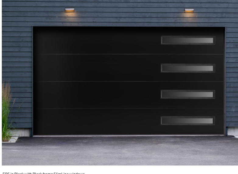
EOS in Black with Black frame SlimLine windows